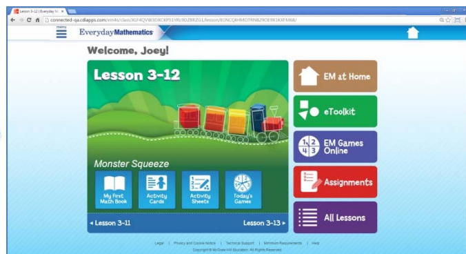
Student Learning Center: Landing Page