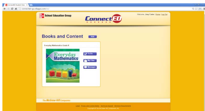
Content List for Student